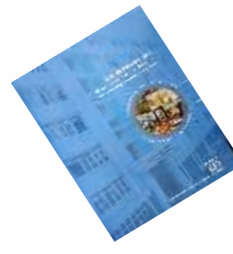
Construction product in India