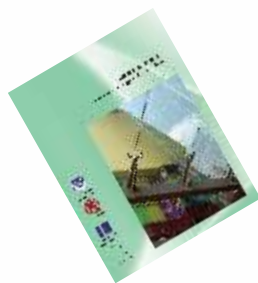
Guide lines - human safety