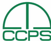
CONFEDERATION OF CONSTRUCTION PRODUCTS & SERVICES