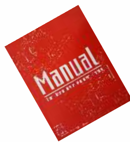
Manual for hand held power tools