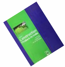
Construction Production in India