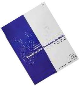
Construction Products in India